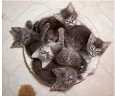
The Grey Family