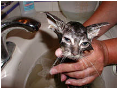
Poor Earl Grey