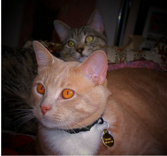
Ernie and Bodhie

Of course I cannot put out a newsletter at Easter time and not include this picture that absolutely cracks me up: