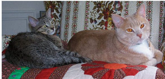
Best buddies - Bodhi and Ernie For more of Carol's great pictures, see page 9