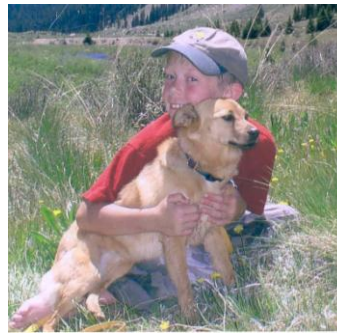
Sheba (formerly Samantha) and her new person.

Samantha's family and Chloe, our newly adopted kitty cat.