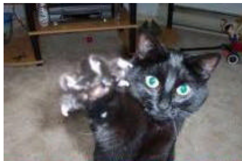
This is what I would see if I tried to put a Santa costume on one of our cats!