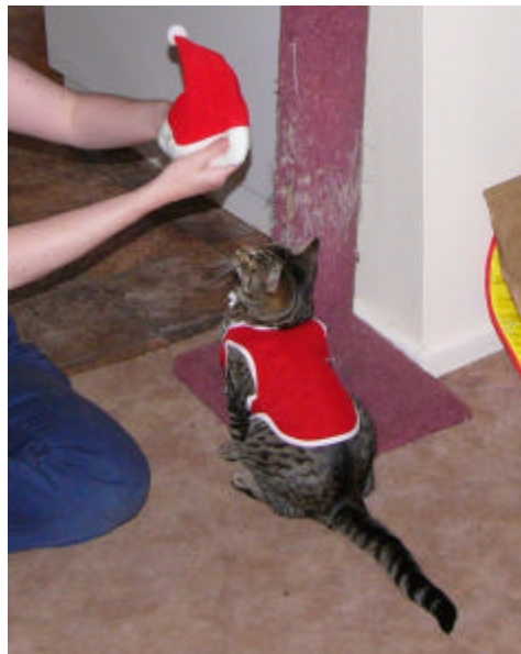
This cat must be drugged – it's sitting there patiently waiting to get its Santa Claws hat put on - with no claws out!